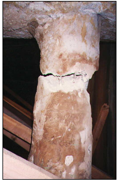
A defective pile

Current pile inspection techniques involve dynamic load or sonic integrity testing. These are relatively fast to perform. However, the quality of results depends strongly on the skill of the operator and the results are often open to interpretation. Some studies also indicate that defects representing less than 50% of cross sectional area are not detectable via sonic integrity testing.