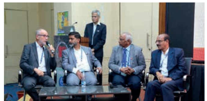
Panel discussion during DFI India 2019, NAC Hyderabad

Visit www.dfi.org/India2020 regularly for more details and updates